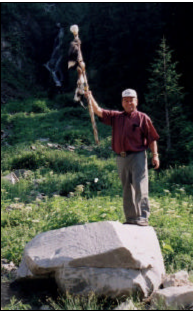
On This Rock

To all you guys out there, if you have questions or need help with VA benefits ask. Don't be so proud that you can't ask us B Co. or your local VA. There is much help out there. Take advantage of it now, as the sign says Uncle Sam owes you. I know your feelings first hand, we have to deal with many health problems from agent orange to diabetes to Post Traumatic Stress Disorder. We can deal with these things together, like we did when we were in Viet Nam. Trust in your fellow comrades again, we won't let you down. As your Chaplain I will do anything within my power to help you guys out at this time of your life.